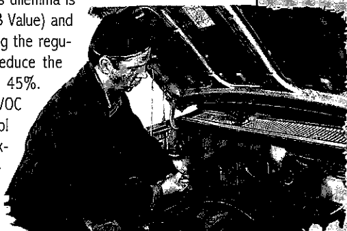
Example 2: VOC Compliant Engine Degreaser (Solvent Type/Hose Off)